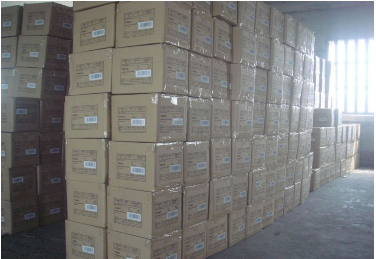
Finished goods cartons for shipment.